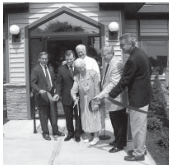
A special ribbon cutting ceremony celebrated Southport Internal Medicine's $400,000 expansion project.

Financial assistance is available to those individuals determined to be financially ineligible for Medicaid, but whose gross income does not exceed the guidelines outlined in the table below. The Hospital's Financial Assistance Committee may also consider applicants with unusual circumstances falling outside the guidelines. Determination of eligibility is made within 30 days of receiving the application and proof of income.