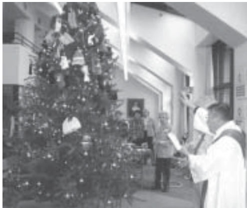
St. Joseph's "Mitten Tree" – During the holiday season employees donated hats, scarves, gloves, and mittens to help keep the needy of our community warm during the winter season.

- Reaffirmed on December 19, 2001 by St. Joseph's Board of Directors