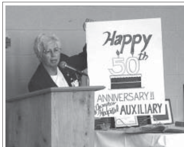
St. Joseph's Auxiliary celebrated its 50 th year of service to St. Joseph's in 2004.

St. Joseph's will continue to provide long term nursing care by an approach that provides preventative, therapeutic, and rehabilitative services.