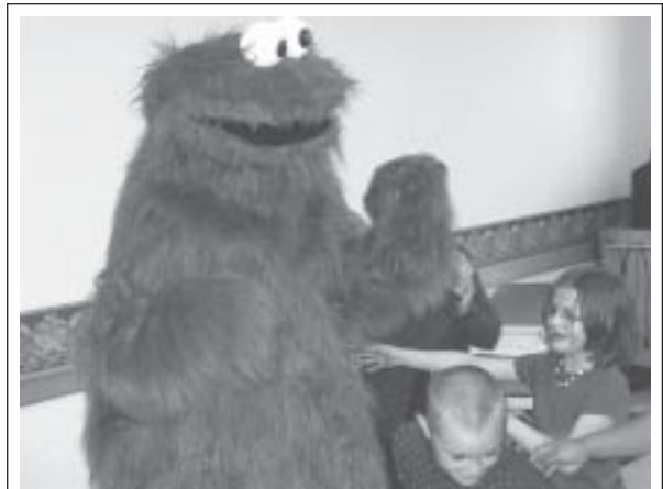
Special Visitors to St. Joseph’s like the Sesame Street character Cookie Monster are always a fan favorite for kids.

As a result of St. Joseph’s involvement in collecting feedback from residents and patients as well as participating in numerous community coalitions and organizations the following could be considered as priority health care needs for our community: