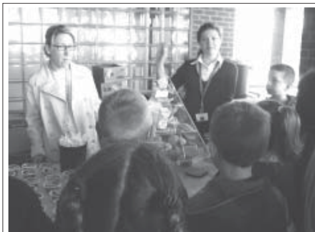
Learning healthy eating habits at a young age was just one of the presentations at St. Joseph’s annual Children’s Health Fair.