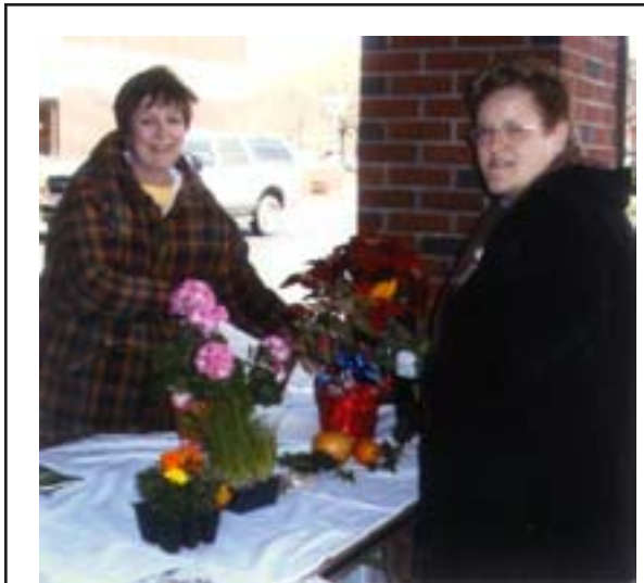
Emergency Department staff members presented "The Dangers of Poison Plants" for the third grade students attending the annual Children's Health Fair.