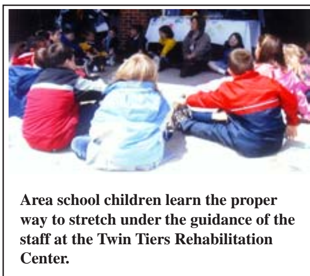
Area school children learn the proper way to stretch under the guidance of the staff at the Twin Tiers Rehabilitation Center.

* Children's Health Fair- In early May 178 third grade students from the three schools participating in the Adopt-A-School program attended a half-day interactive health information program at the Hospital. The topics ranged from better nutrition habits to the importance of physical fitness.